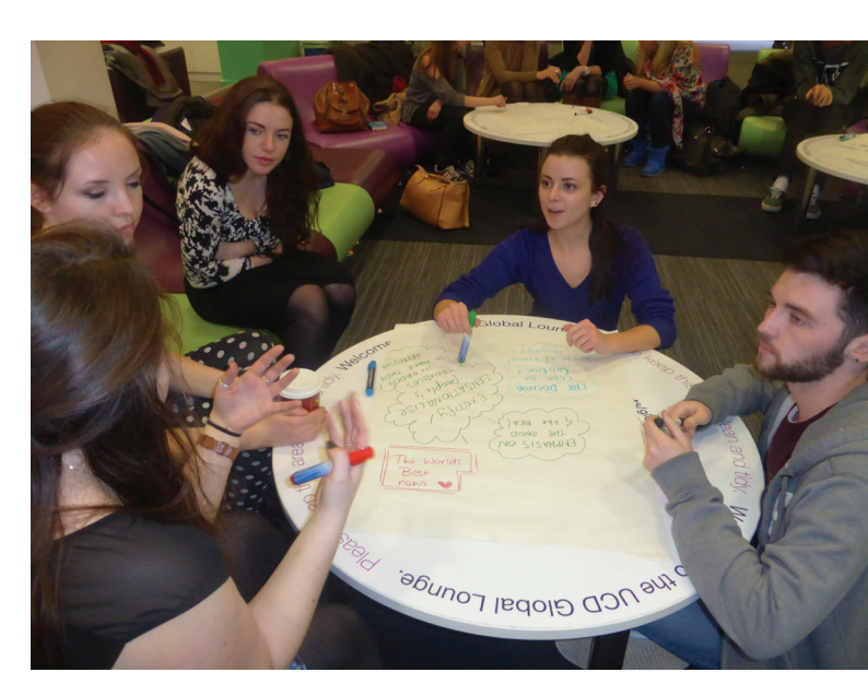
Returned volunteers taking part in a Skills in Development Education course.